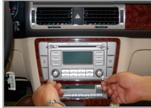
4. The four keys inserted in place then pull out, remove the original CD machine