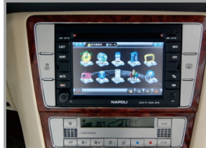
9. The appearance after installed the host