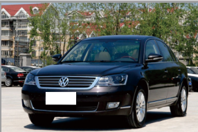
1. VW Passat original appearance