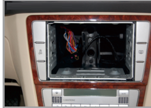
6. Fix our frame for installation