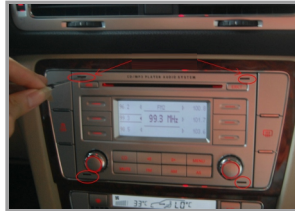
3. Insert the special key to the four holes marked in the picture (The slope side of the key should be inside)