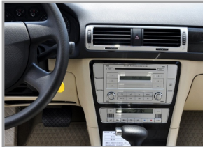
2. VW Passat original dash board