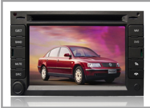
8 . Our special car DVD player appearance