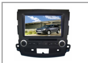
8. Our special car DVD player