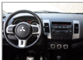
2. Original CD