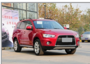
1. Car appearance