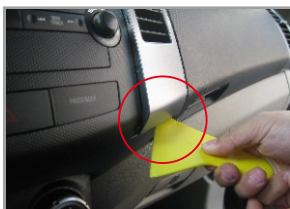
3. Use a crow plate pry the top decorative panel from the dashboard, and remove decorative panel