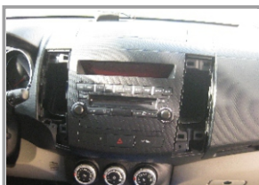
4. The appearance of after removed