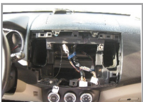
7. The appearance after removed the original CD machine