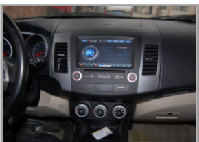
9. The appearance of installed the car DVD player