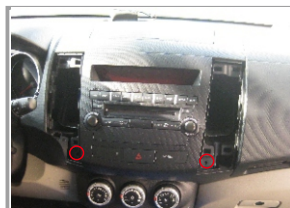
5. Remove the fixing display decorative panel screw with a screwdriver, remove the display decorative panel