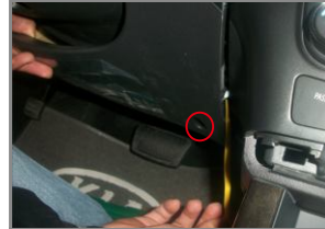
12. Remove the fixed screws