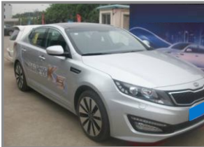
1.The Kia Optima car appearance