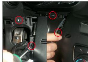
13.Remove the 2 fixed screws