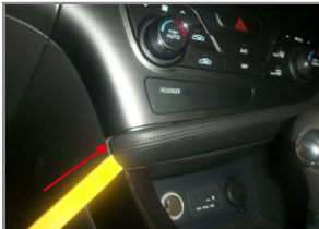
4. From the dashboard low left trim strip begin to pry, pry loose and hand up to board can pull out all the buckles