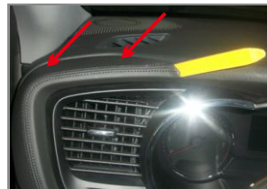
15.Remove the air conditioner side trim (a total of 5 buckles, distributed as follows the arrow) , the method same with the dashboard