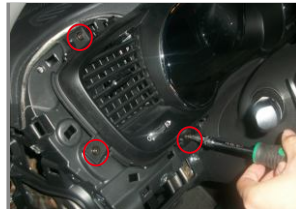
16.Remove the 3 fixed screws