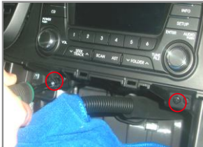
20.Remove the 2 fixed screws on the device