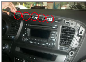
8.Remove screws from strip