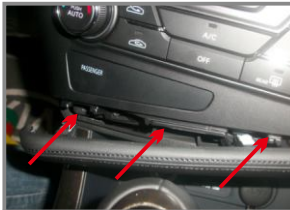
5. From the dashboard low trim strip begin to pry, pry loose and hand up to board can pull out all the buckles