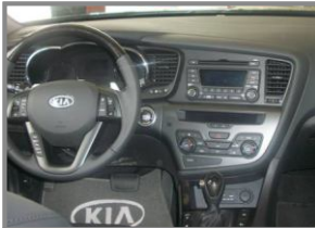
2. The dashboard