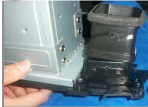
26.Remove left and right air gate of the original car , which is arranged on our decorative strip. Note: the screw removed, in addition to the 3 fixing screws air-conditioning window slightly smaller, the rest are all the same size