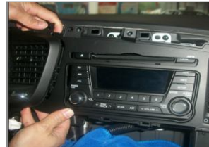
18.The removed air conditioner gate