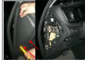
10.Pry the baffle from the front left door, and removed the baffle