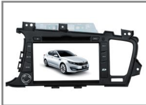
25.Our special car DVD player