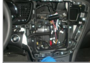
24.Remove the decorative frame