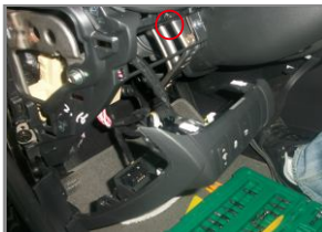
14.Remove the 1 fixed screws