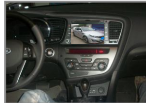
27.The effect after installed our DVD player