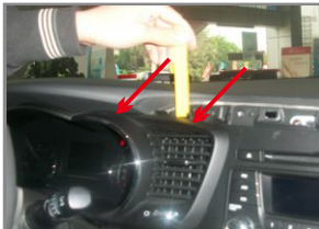
17.Pry the air conditioner gate