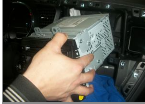
23.Pull out the CD machine and take off the connection cables