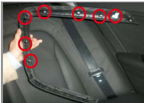
7.The removed strip(total 9 buckles)