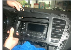
21.Remove the decorative trip