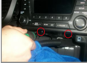
22.Remove the 2 fixed screws under the device