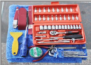
3. Combined sleeve, plastic crow plate, 3M electrical adhesive, 3M adhesive, cotton and screwdriver