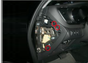
11.Remove the 3 fixed screws