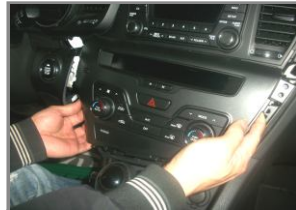
19.Remove the air conditioner panel from dashboard (Before pulling pls use tape to pack the sharp location, so as not to damage the dashboard shell)