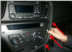
6. From the dashboard low right trim strip begin to pry, pry loose and hand up to board can pull out all the buckles