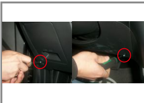
9.Remove the 2 screws under the driver's seat plate