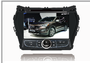
5. Install our host