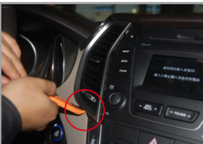
3.Pry the CD Player panel from left and right bottom then pull out the panel from bottom to top