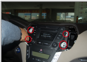
4.Remove the panel will display screws ,remove the screws