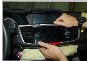
7. Take out the CD machine