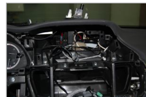
17. The effect