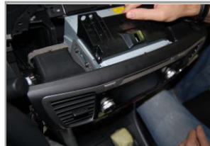
8. Take out all connection cables