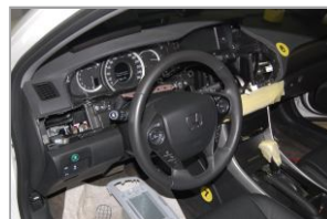
14. The effect