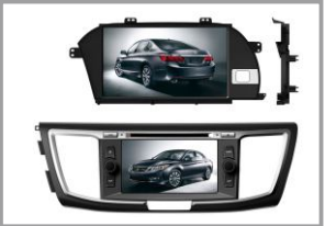
20. Our special car DVD player