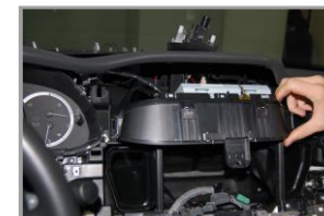
16. Remove the display screen and take out the connection cables