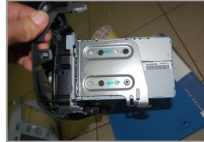
19. Remove host left and right installing brackets, and installed on our host