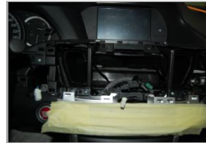
9. The effect after removed the CD machine