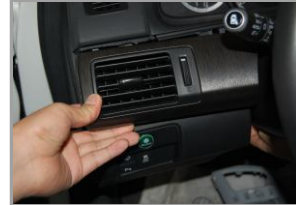
12. Remove the air-conditioning air outlet panel