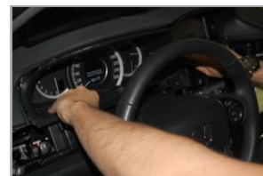
13. Remove the instrument panel from the dashboard