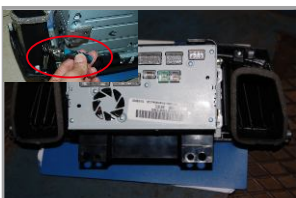
18. Remove the air-conditioning panel on the original vehicle, and the air conditioner panel mounted on our host