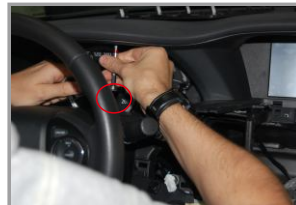
10. Remove the left frame screws on the dashboard