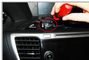
5. Remove the panel left screw with a screwdriver