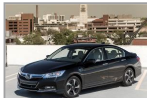
1. The Honda Accord 2014 appearance