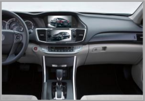
21. The effect after installed our special car DVD player