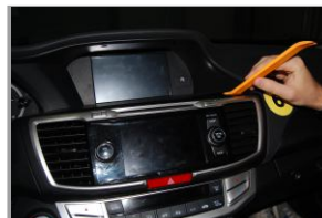
3. Use a crow plate pry the decorative frame from dashboard