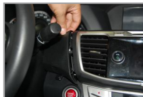
6. Pry the left panel from the dashboard area