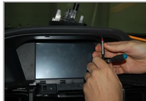
11. Remove the right frame screws on the dashboard