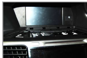
4. The effect