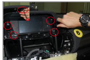
15. Use a screwdriver to remove the screws around the fixed display screen.