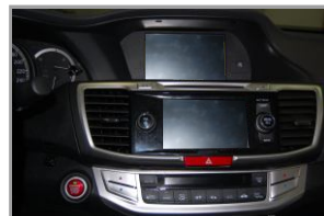
2. The dashboard