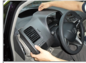
9.Take out the frame