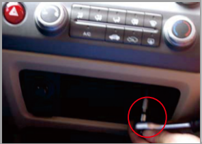
11.Screw out the two bolts under the original CD Player