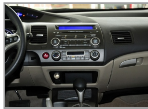
2.Original car center control