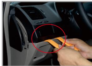
6.Pry the instrument desk to make it loose