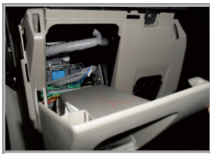
7.Take out the panel