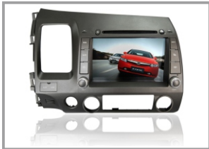
14.Full set of special unit from the company