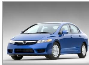
1.Appearance of Honda Civic