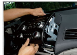
13.Take out the original CD Player