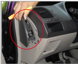
4.Open the left air conditioning cover