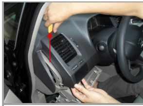
8.Pry the air conditioning frame and make it loose