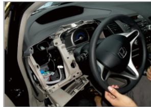
10.Picture of taking away the air conditioning frame