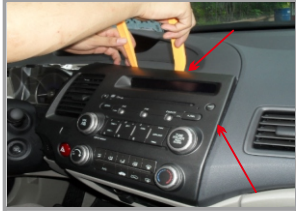
12.Then pry from the upper gap of the panel