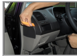
3.Pry the air conditioning cover on beside the left door to loose it