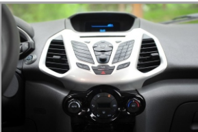
2.The dashboard picture