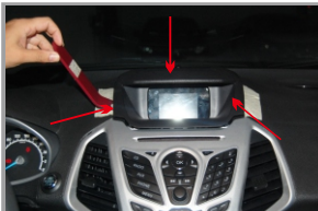
3.With the lever prize panel in the dashboard area, remove the display frame