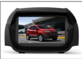
8. Our specail car DVD player for Ford Ecosport