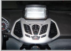
9. Our specail car DVD player for Ford Ecosport