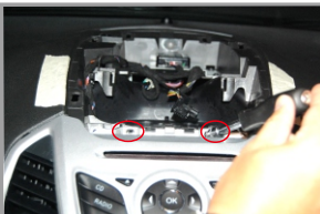
5.Remove the fixed screw on decorative panel , and remove the decorative panel