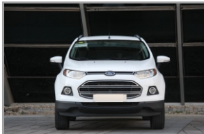
1.The appearance of Ford Ecosport