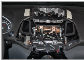
7.The appearance of removing the host