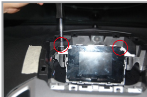
4.Remove the fixed screws on the screen, and pull off the connecting screen cables, then remove the screen.