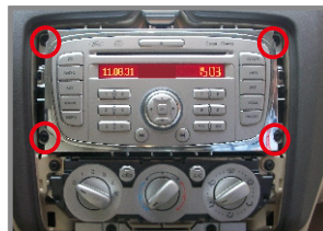
8. Take off the screws of the host and all connection cables