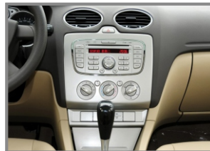
2. The dashboard