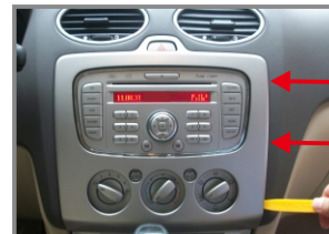
4. Use a crow plate pry the decorative frame from dashboard