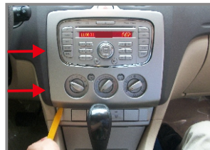
5. Use a crow plate pry the decorative frame from dashboard