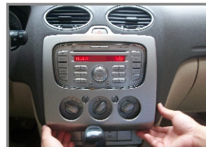
6. Remove the decorative frame