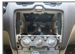
9. The effect after removed