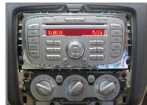
7. The effect after removed the frame