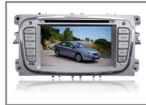
10. Our special car DVD player