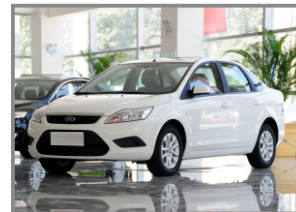
1. The Ford Focus old car appearance