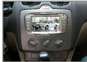
11. The effect after installed our DVD player