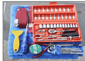
3. Combined sleeve, plastic crow plate, 3M electrical adhesive, 3M adhesive, cotton and screwdriver