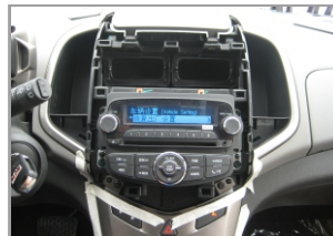
4.The appearance of after removed