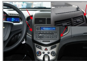
3.Use a crow plate pry the decorative panel from the dashboard, and remove decorative panel