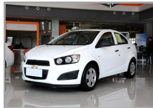
1.Chevrolet Aveo 2012 car