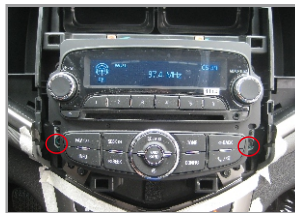
5.Remove screws in the host, take out the CD original machine