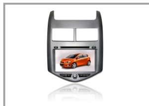
7.Our special car DVD player