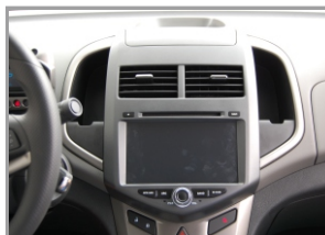
8.The appearance of installed the car DVD player