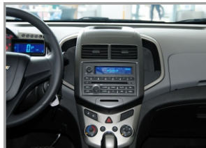
2. Original CD