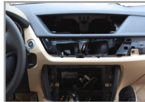
13. Pull up all connected cables , there is what it looks like