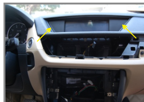
11. Use plastic crowbar to take out of displayer face frame