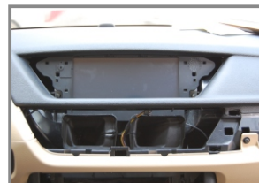
12. Take off all screws of displayer by screwdriver