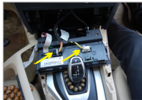
5.Pull up all connected cables