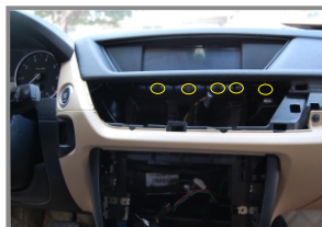
10. Push backward 5 all spring leaves on the panel