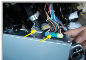
7.Pull up all cables connected with original CD player