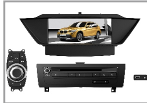
16.Full set of special unit from the company