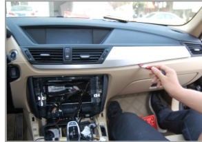
8.Use plastic crowbar to open up decoration panel of air conditioner, then take out of air conditioner panel