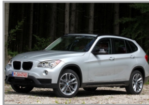
1.BMW X1 Original Appearance