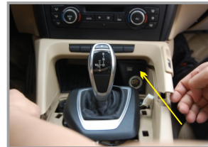
15. Use plastic crowbar to open up face frame for gear,take out of original USB port panel as well, and replace it as special USB port from the company