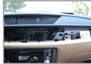
9.what it looks like after taking out of panel