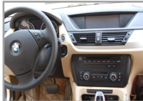
2.BMW X1 Original Dash Board