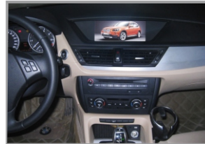
17.Please follow the installation steps above to set up special unit. There is final appearance after installation.