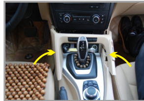
3. Use plastic crowbar to take out of plastic panel around i Drive