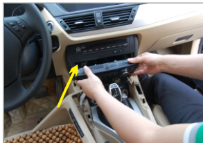
4.Use plastic crowbar to take out of air conditioner panel