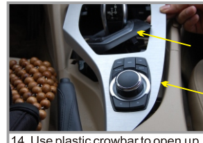
14. Use plastic crowbar to open up decoration panel for gear, then take out of control unit with knob around iDriver, and replace it as special control unit from the company