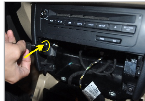
6.Use screwdriver to take off all screws of original CD player , then take out of original CD player